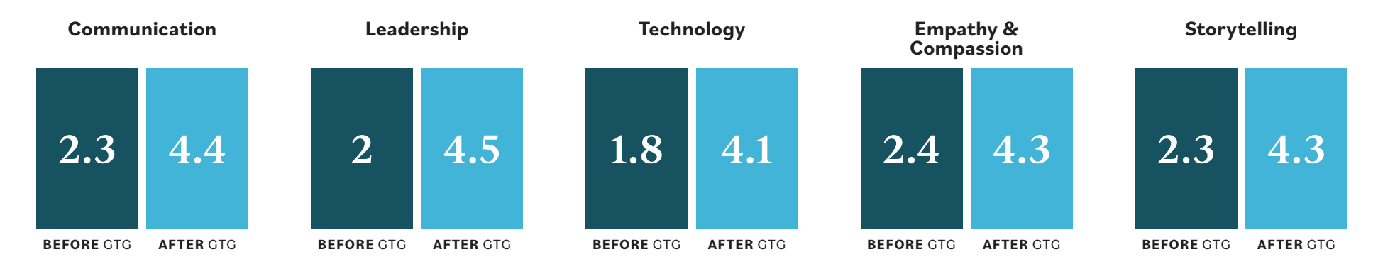
Figure 1 (above): Improvement in participants' skills as a result of Girl-talk-Girl Kazakhstan program (on a 5-point scale)