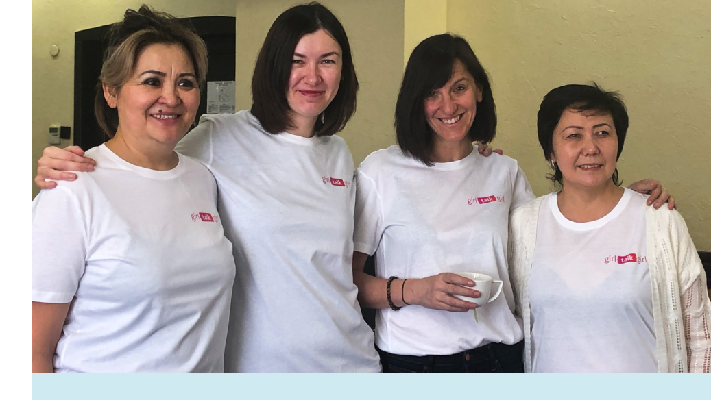
For 17 years , Rodnik has promoted gender equality, serving women and children, including those affected by marital conflict, migrant women, and victims of human trafficking.

With our third Peer-to-Peer Dialogue Program Award from the U.S. Embassy Moscow, implemented by Eurasia Foundation, we are continuing to amplify the voices of young women affected by GBV across the U.S and Russia through WebinHERS. Through consultation with diverse young women and grassroots organizations across both countries, we are providing educational and interactive webinars on GBV, reaching and connecting young women worldwide.